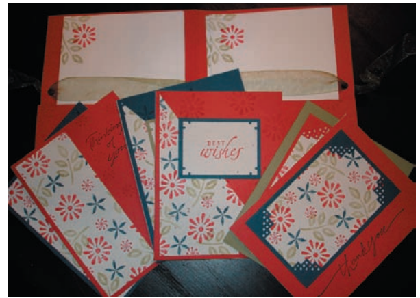
Artwork copyright 1990-2005 STAMPIN' UP!® All rights reserved